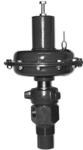
Figure 1. Model 5127 with Adjustable Actuator