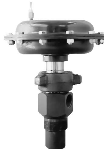
Figure 2. Model 5127 with Non-Adjustable Actuator